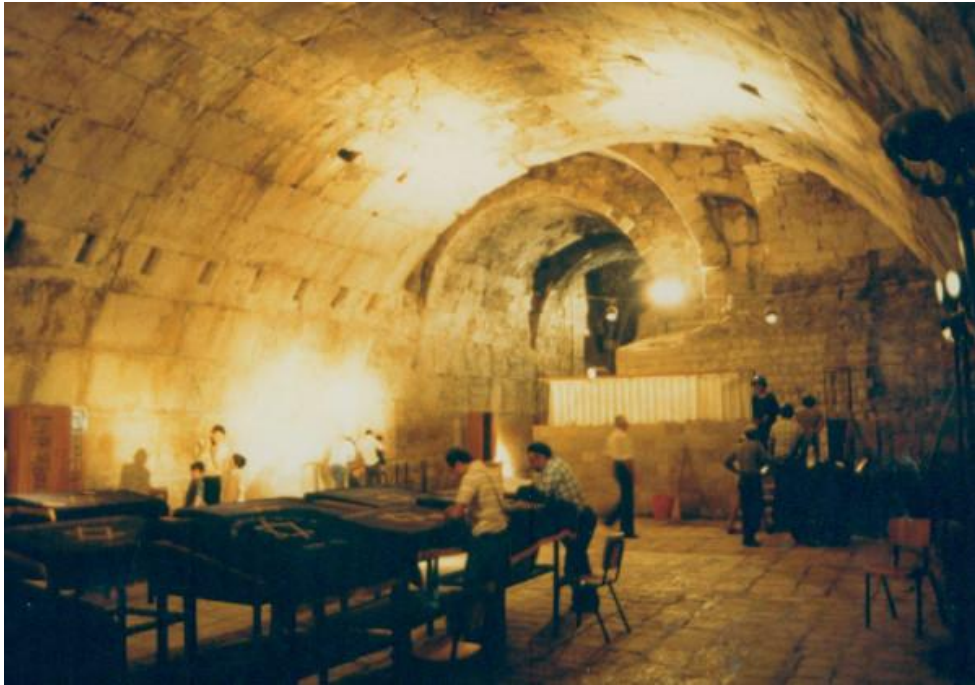
Men's prayer room to the left of the Wailing Wall, Jerusalem

Genesis 17:8,10-12,13 (see Leviticus 25:23 on page 62)