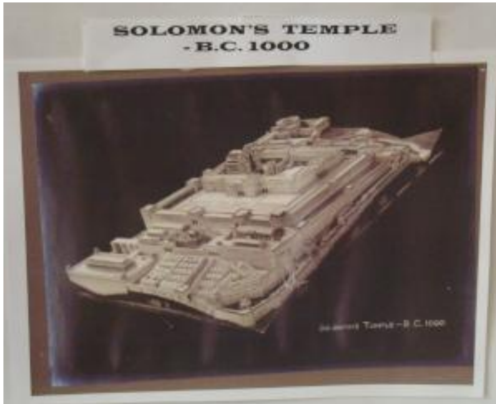
Photo taken at Christ Church in Jerusalem Replica of Solomon's Temple

Now when Solomon had made an end of praying, the fire came down from heaven, and consumed the burnt-offering and the sacrifices; and the Glory of the LORD filled the House.