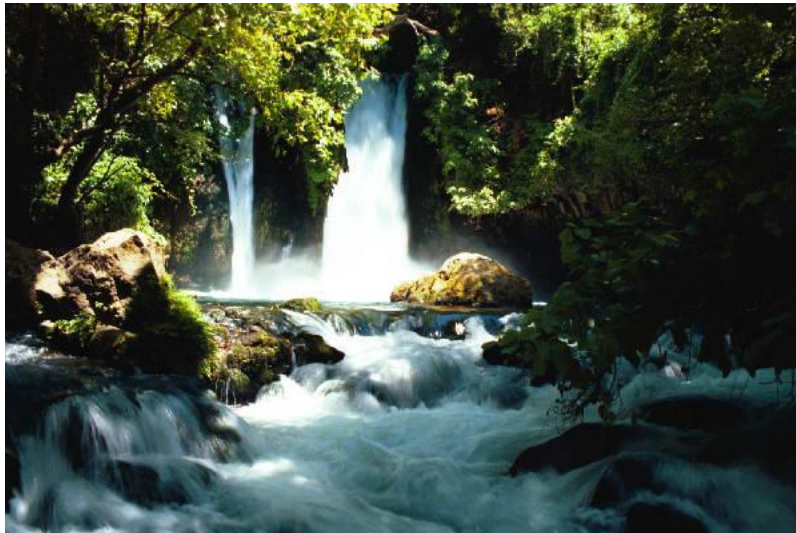
Waterfall in Northern Israel

In that Day there shall be a Fountain opened to the House of David and to the inhabitants of Jerusalem, for purification and for sprinkling. Zechariah 13:1