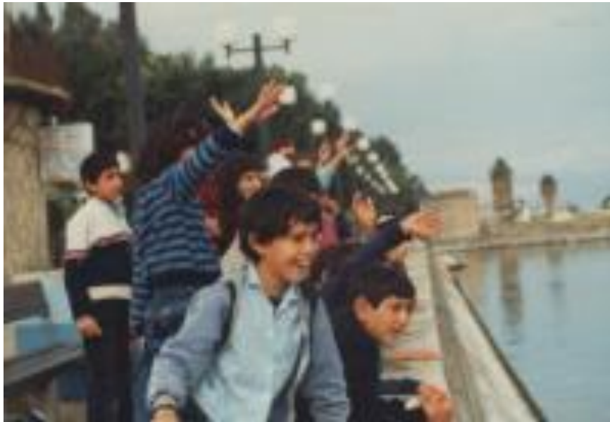
Jewish children by the Sea of Galilee, Israel

`Neither shall thy name any more be called Abram, but thy name shall be Abraham ;