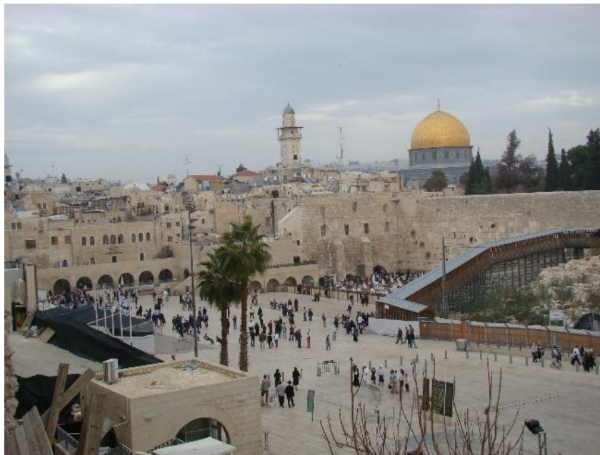
The Wailing Wall in the Jerusalem Old City

... And He set my feet upon a Rock, He established my goings. And He hath put a new song in my mouth, even praise unto our God; Many shall see, and fear, and shalt trust in the LORD. Psalm 40:3,4