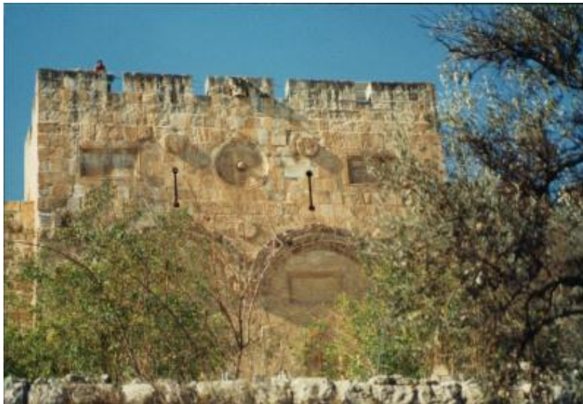
The Eastern or Golden Gate in Jerusalem

This is the Day which the LORD hath made ; We will rejoice and be glad in it . We beseech Thee, O Lord, Save now (Hosanna) ! We beseech Thee, O LORD, make us now to prosper! * Blessed be He that cometh in the name of the LORD ; * We bless you out of the House of the LORD. The LORD is God, and hath given us light; Order the festival procession with boughs, even unto the horns of the altar. Thou art my God, and I will give thanks unto Thee; Thou art my God, I will exalt Thee. O give thanks unto the LORD, for He is Good, for His Mercy endureth for ever. Psalm 118:19-29