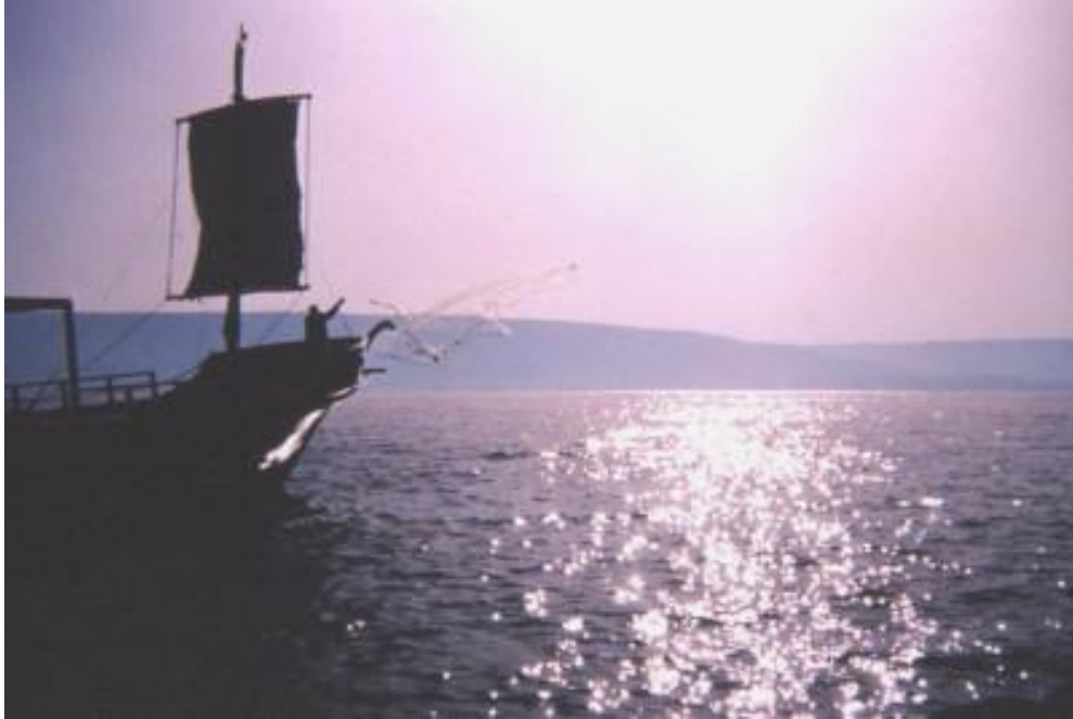
fishing boat on the Sea of Galilee (Kinneret)

... by the way of the sea, beyond the Jordan, in the district of the nations. Isaiah 8:23