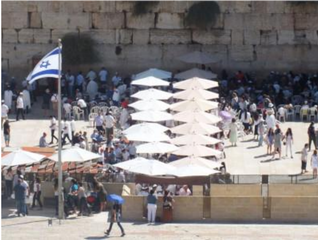
The Wailing Wall in Jerusalem

But chose the tribe of Judah, the Mount Zion which He loved. Psalm 78:68