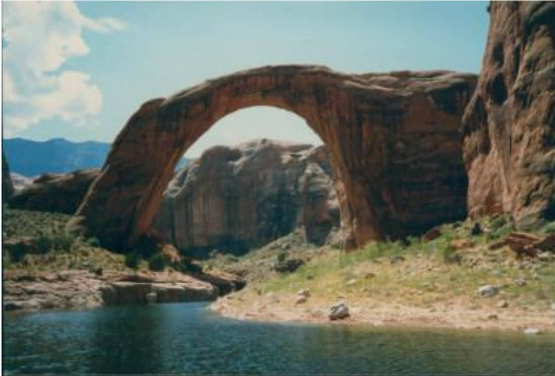
Rainbow Bridge, Arizona

And I raised up of your sons for prophets, and of your young men for Nazirites.