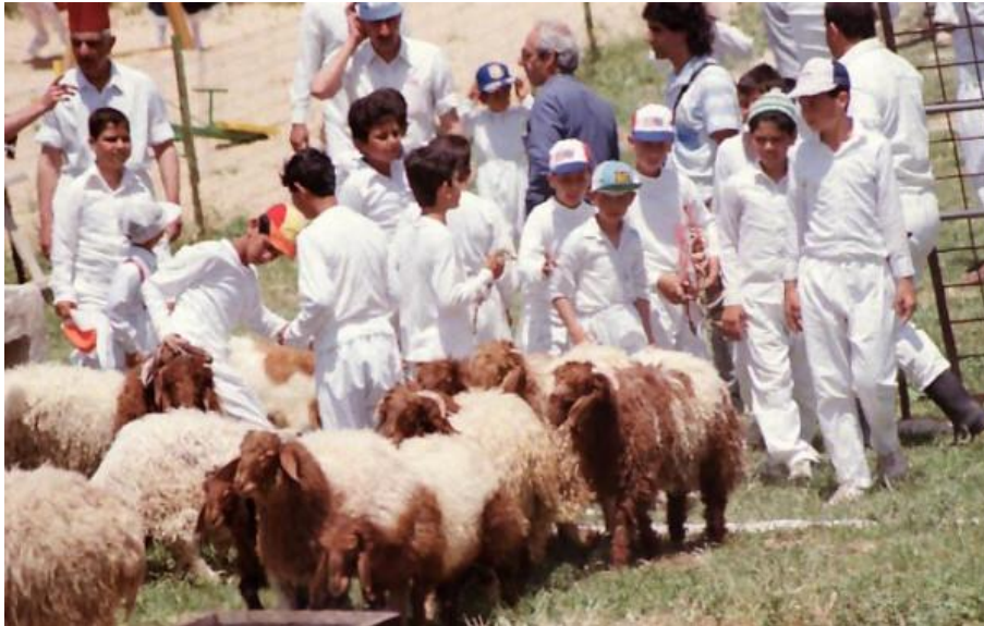
Samaritan Passover in Israel with sacrifice of lambs

Ye are standing this day all of you before the LORD your God: ... even all the men of Israel, your little ones, your wives, * and the stranger that is in the midst of thy camp * ... that thou shouldst enter into the Covenant of the LORD thy God - and into His oath - which the LORD thy God maketh with thee this day; that He may establish thee this day unto Himself for a people, and that He may be unto thee a God, as He spoke unto thee, and as He swore unto thy fathers, to Abraham, to Isaac, and to Jacob. Deuteronomy 29:9-12