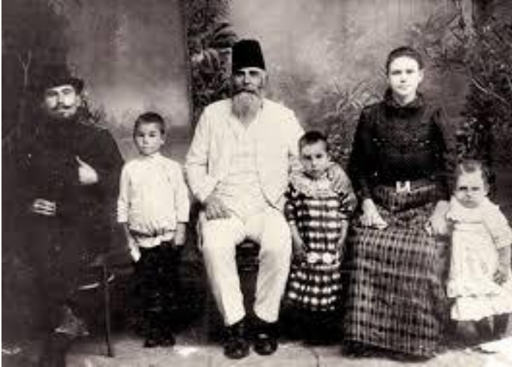
Russian peasants who made Aliyah to Galilee, Israel

Moreover concerning the stranger that is not of Thy people Israel, when he shall come out of a far country for Thy name's sake - for they shall hear of Thy great name, and of Thy mighty Hand, and of Thine outstretched Arm - when he shall come and pray toward this House; hear Thou in Heaven Thy dwelling-place, and do according to all that the stranger calleth to Thee for; that all the people of the earth may know Thy name, to fear Thee, as doth Thy people Israel, and that they may know that Thy name is called upon this House which I have built. First Kings 8:41-43