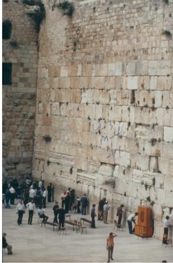
Wailing Wall in Jerusalem

Thou, O LORD, art our Father, Our Redeemer from Everlasting is Thy Name.