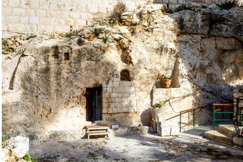
Garden Tomb in Jerusalem

His Body shall not remain all night upon the tree, but thou shalt surely bury Him the same day; for He that is hanged is a reproach unto God; Deuteronomy 21:23