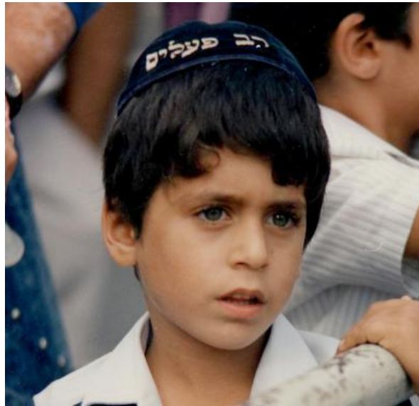
young boy in Israel

When thou art come unto the land (Israel) which the LORD thy God giveth thee, and shalt possess it, and shalt dwell therein; and shalt say: 'I will set a king over me, like all the nations that are round about me'; thou shalt in any wise set him king over thee, whom the LORD thy God shall choose; one from among thy brethren shalt thou set king over thee; Deuteronomy 17:14,15