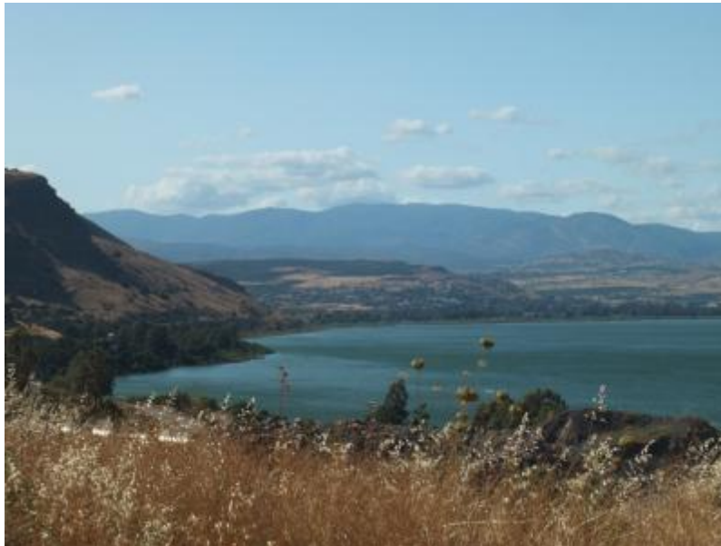
Mount Hermon seen from the west of the Sea of Galilee, Israel

The LORD said unto Me, `Thou art My Son ...' Psalm 2:7