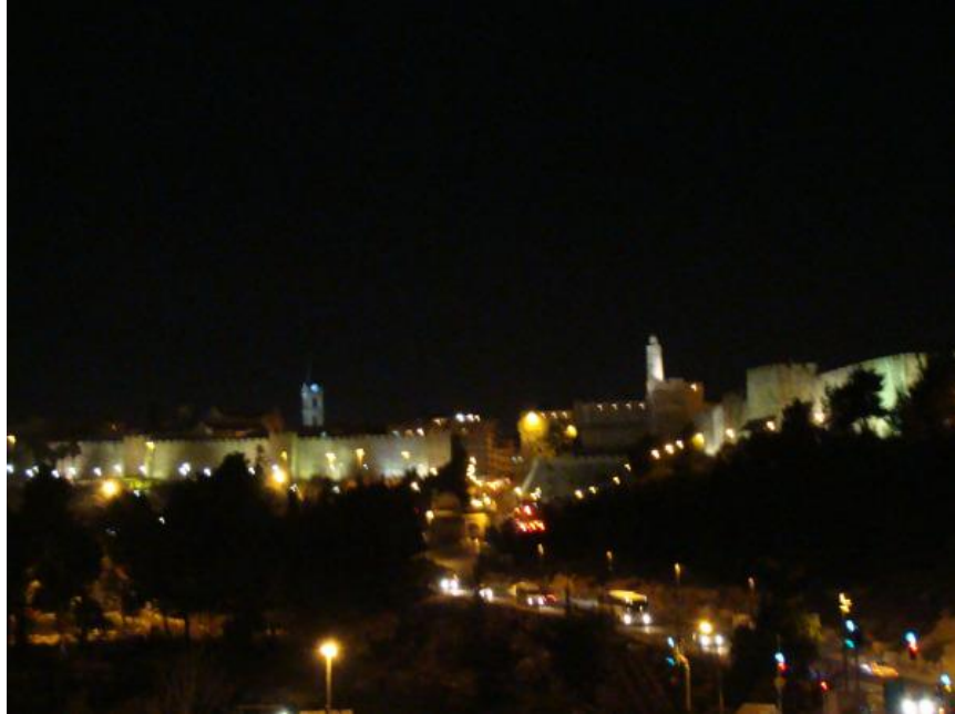
Night view Jaffa Gate in Jerusalem

Now the days of David drew nigh that he should die; and he charged Solomon his son, saying: I go the way of all the earth; Be thou strong therefore, and show thyself a man; and keep the charge of the LORD thy God, to walk in His ways, to keep His statutes, and His commandments, and His ordinances, and His testimonies, according to that which is written in the law (Torah) of Moses, that thou mayest prosper in all that thou doest, and whithersoever thou turnest thyself; That the LORD may establish His Word which He spoke concerning me, saying: If thy children take heed to their way, to walk before Me in truth with all their heart, and with all their soul, there shall not fail thee, said He, a man on the Throne of Israel.