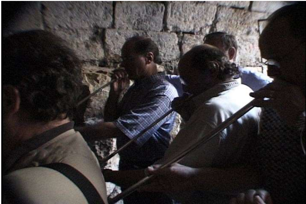
Seven Silver Trumpets sounded at Gihon Spring, 9/30/2000

The Presence of God showed up powerfully on that day down there by the waters of the Gihon Spring, as God's Presence fell mightily when the 7 silver trumpets were sounded! 1 st Kings 1:39