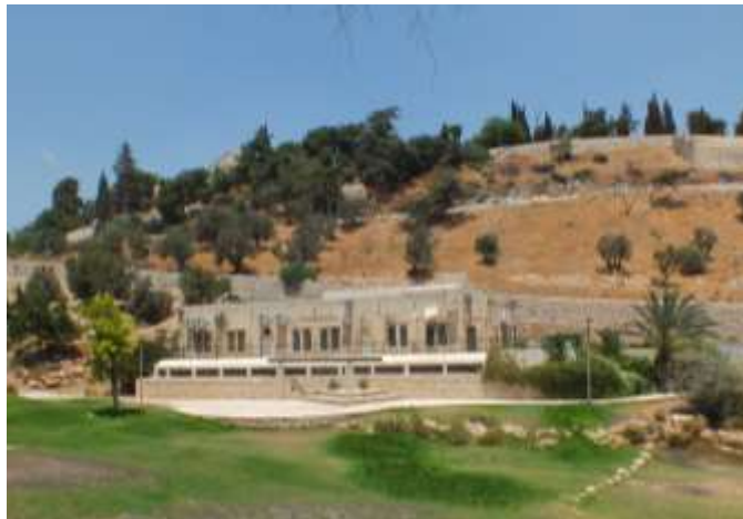
The Louis and Tillie Albert Youth Music Center in Hinnom Valley