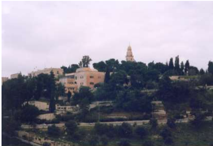
Western side of Mount Zion Hill with the Hinnom Valley below

Amos 3:7 ... Surely the LORD does nothing unless He reveals His plans to His servants the prophets.