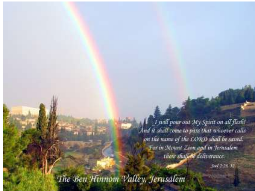
Double Rainbow in 2012 over the Hinnom Valley

I believe this coming Revival will be so much greater than either the Azusa Street Revival of 1904-1906, or the Welsh Revival of 1904. For it will be the last Great move of God's Holy Spirit before the End of this Age. It will impact the whole world, drawing multitudes of believers to Jerusalem from all over the world, who will then go back to their home countries filled with God's Powerful Anointing from these Revival Fires from Jerusalem, so that many others in their own countries may also be blessed and anointed with this Revival Fire, like what happened in the early 1900's.