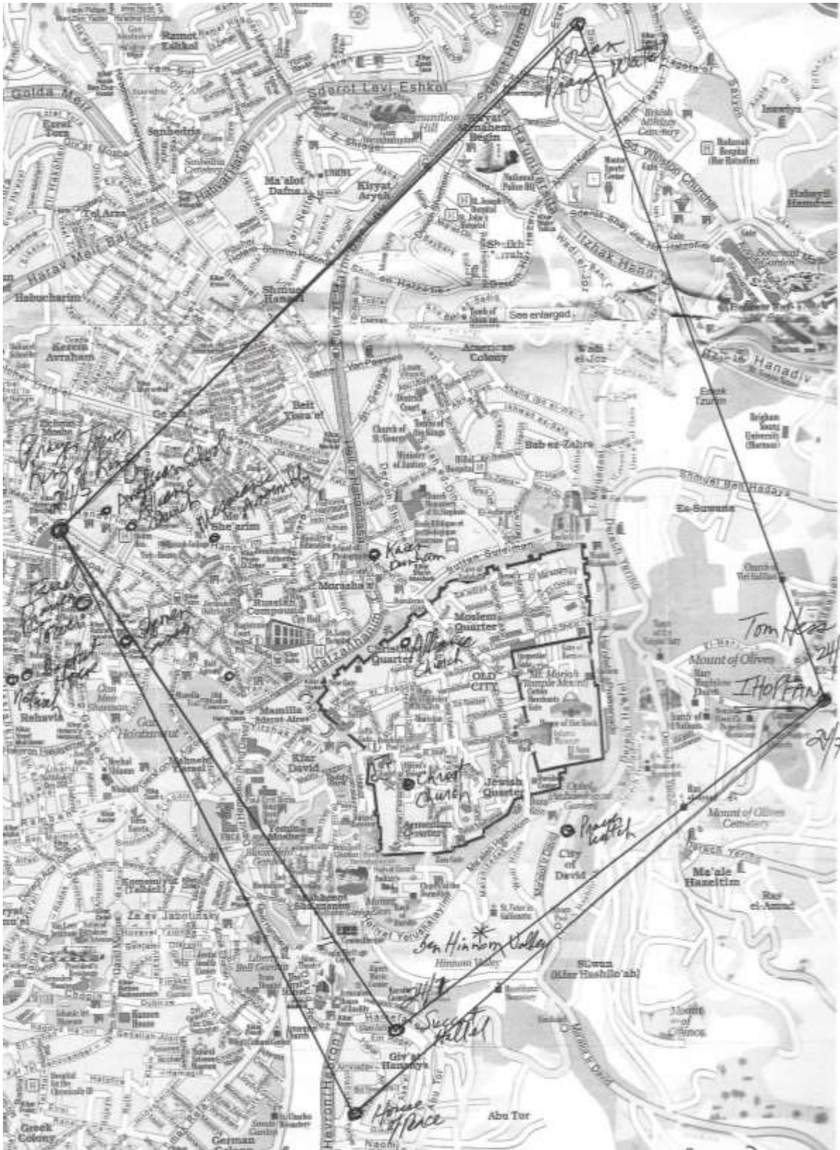
Restored Tent of David over Jerusalem, map of September, 2015