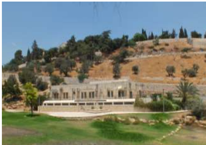
The Louis and Tillie Albert Youth Music Center