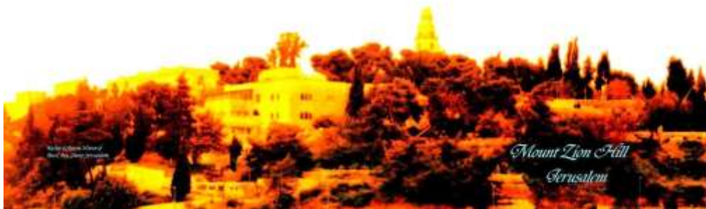
Miracle Golden Picture of western Mount Zion Hill, 2005