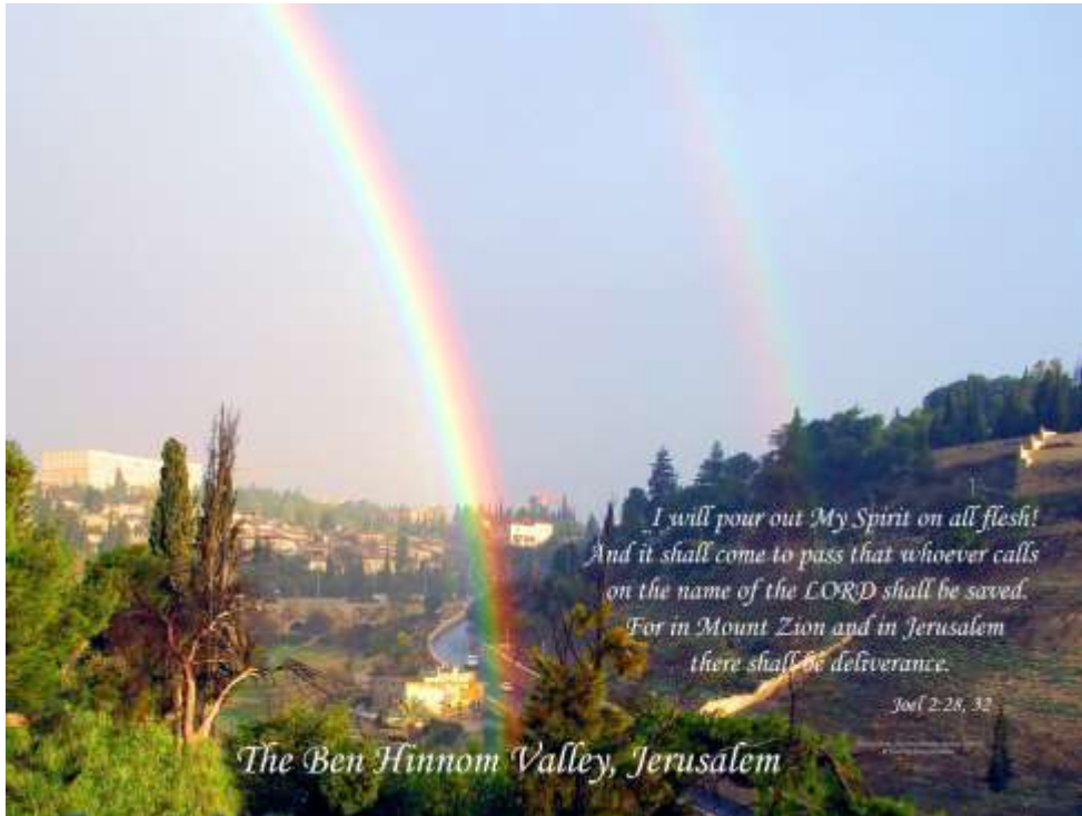
Double Rainbow over Mount Zion Hill and Hinnom Valley, 2012

You shall Arise and have Mercy on Zion, for the time to favor her, yes, the set time is come.